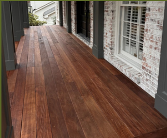
Brown Balau Best Color Match to Ipe!