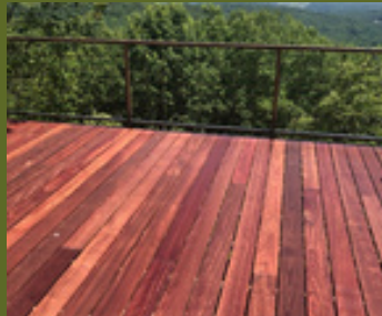
Purpleheart Boldest Appearance & Density