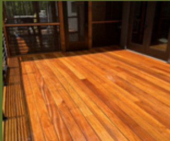
Garapa Best All-Around Performance!