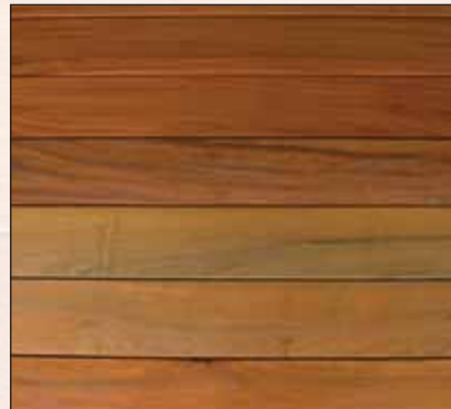
Real Rain Screen RealIpe® siding

For more information visit: www.BrazilianWoodDepot.com www.RealWood.org www.RealRainScreen.com www.RealWoodDepot.com