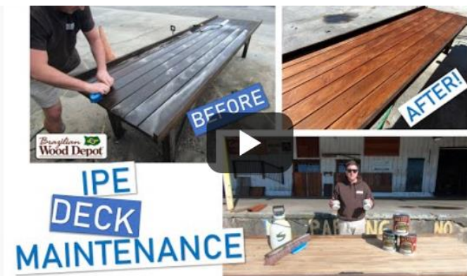
Brazilian Wood Depot's Cleaning/Oiling Video