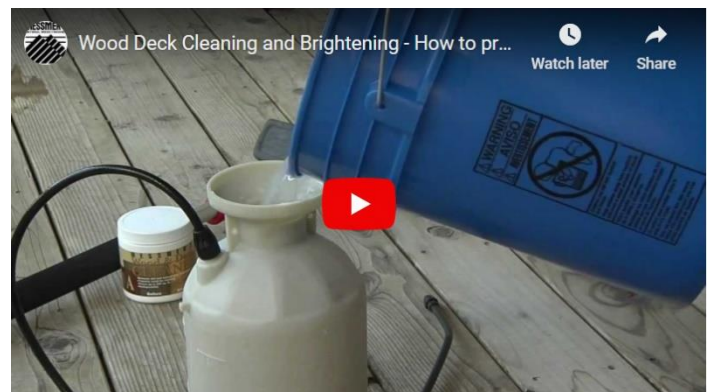
Messmer's Cleaner and Brightener Video