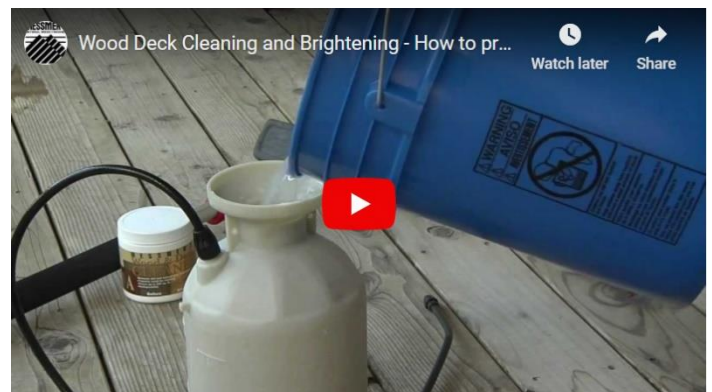
Messmer's Cleaner and Brightener Video